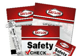
Safety CHECK Vehicle Information Package (Standard)