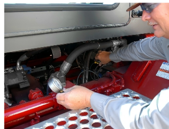
Service & Inspection from Ground Level