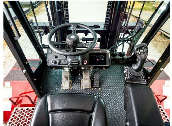
Fully Enclosed 2-Door Cab with Multiple Climate Control Configurations Available (featured cab is shown with available options)