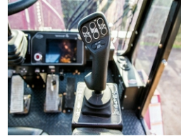
11 Button Command Joystick (Standard)