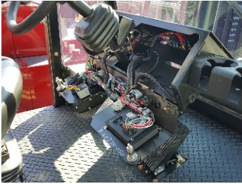
Flip-down Dash with Color/Number Coded Wiring (Standard)

Taylor Lift Trucks are designed with ease of maintenance and serviceability as a key priority. With today's engine and emissions requirements, daily maintenance checks and timely periodic service are the key to your equipment's longevity. All daily checks across the Taylor product line can be accessed from the ground or running board, ensuring that operators can complete these requirements with ease. Also, the sliding hood (on rollers), side service doors and 70 degree tilting cab open to expose the drive train and hydraulics to provide easy access for service and inspection.