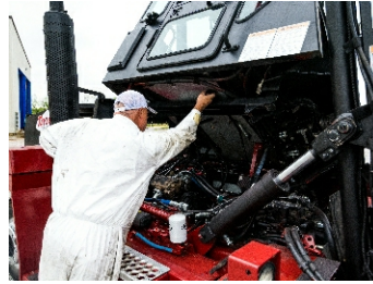
Easy Access to Drive Train & Hydraulics