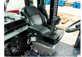
Fully Adjustable Mechanical Seat (Standard)