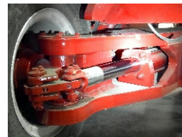
Industry's Toughest Steer Axle (Standard)